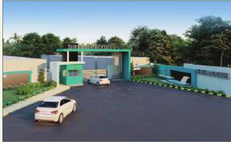
Kongavanipalem, Near Bhogapuram Airport